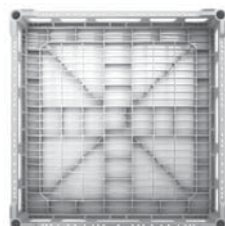
Open Rack Size: 500mm 2