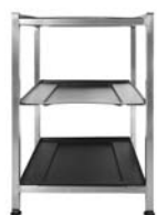
3 Tier Static Rack Unit Size: 50