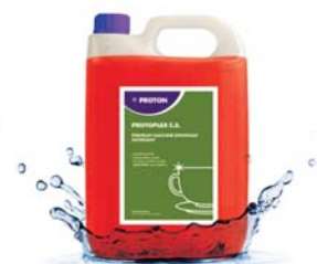
Dishwasher Detergent - Standard

High quality chemicals are essential for cleaning and drying tableware, they are also essential for looking after your dishwasher. Chemicals play an important part in the overall processes of achieving perfect results.