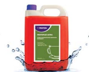
Dishwasher Detergent - Hard Water