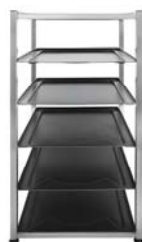
5 Tier Static Rack Unit Size: 50