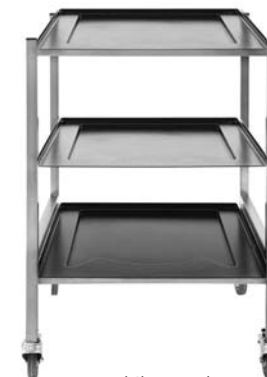
Mobile Stand Size: 50