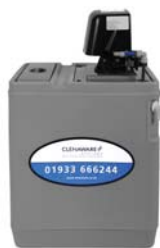
Automatic Water Softeners

Clenaware can supply, install and maintain: