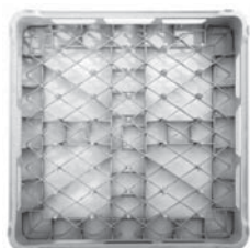
Dish Rack Size: 500mm 2