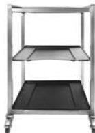
3 Tier Mobile Rack Unit Size: 50