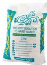
Salt Sizes: 10Kg or 25Kg bags

Calcium Treatment Units Automatic Water Softeners Salt