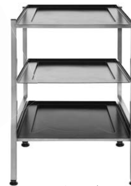
Static Stand Size: 50