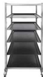
5 Tier Mobile Rack Unit Size: 50